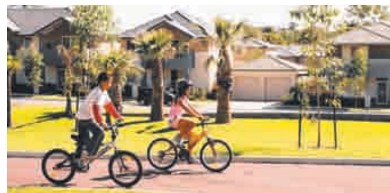
New houses at Botanica blend in with heritage buildings from the days when it was the site of Lidcombe Hospital

2km from Lidcombe train station, and less than 8km by road from Rhodes shopping centre.