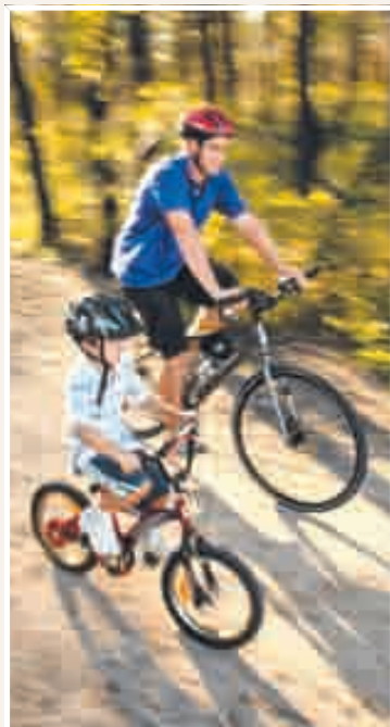
Hike and bike paths traverse parklands at Glenmore Ridge

The couple had looked at several existing properties but thought the value was much better in Glenmore Ridge, considering the cost of the land and being able to build their ideal home from scratch.