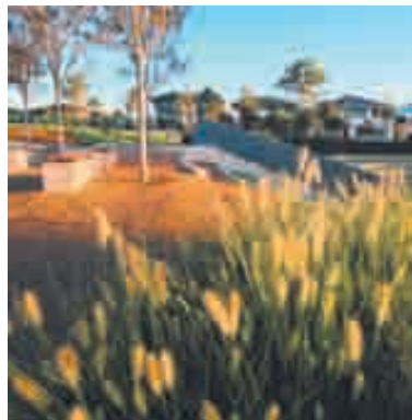
Parkland abounds at Georges Fair

What's on offer: Any lots still available from the first two stages. Further lots will be progressively released as the land is developed.