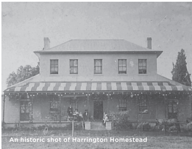
An historic shot of Harrington Homestead